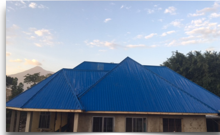
Original Building Renovations