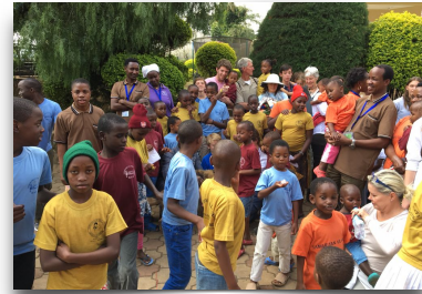
Children and Visitors