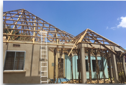
Original Building Renovations