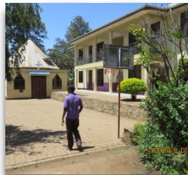
The chapel and main dormitory