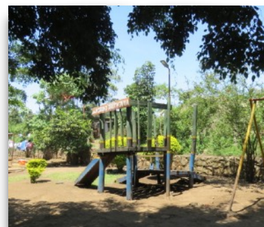
Playground to be Remodeled