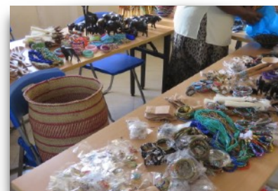
Purchasing Items in Africa for the Farmer's Market