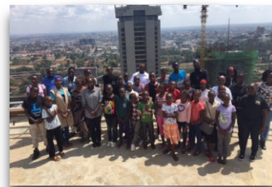
Children in Nairobi