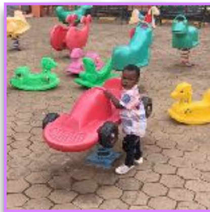
Young Children's Trip