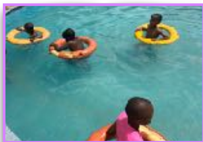
Young Children's Trip