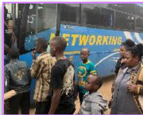
Safari Field Trip