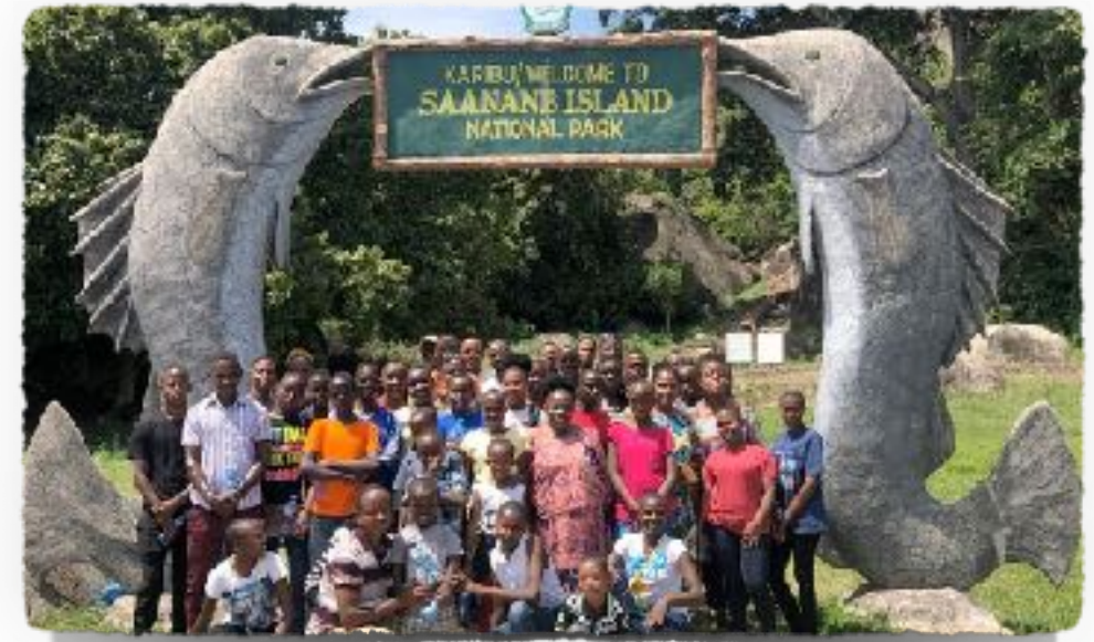
This Year's Summer Field Trip was a Safari to Saanane Island National Park.