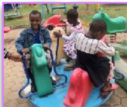
Young Children's Trip